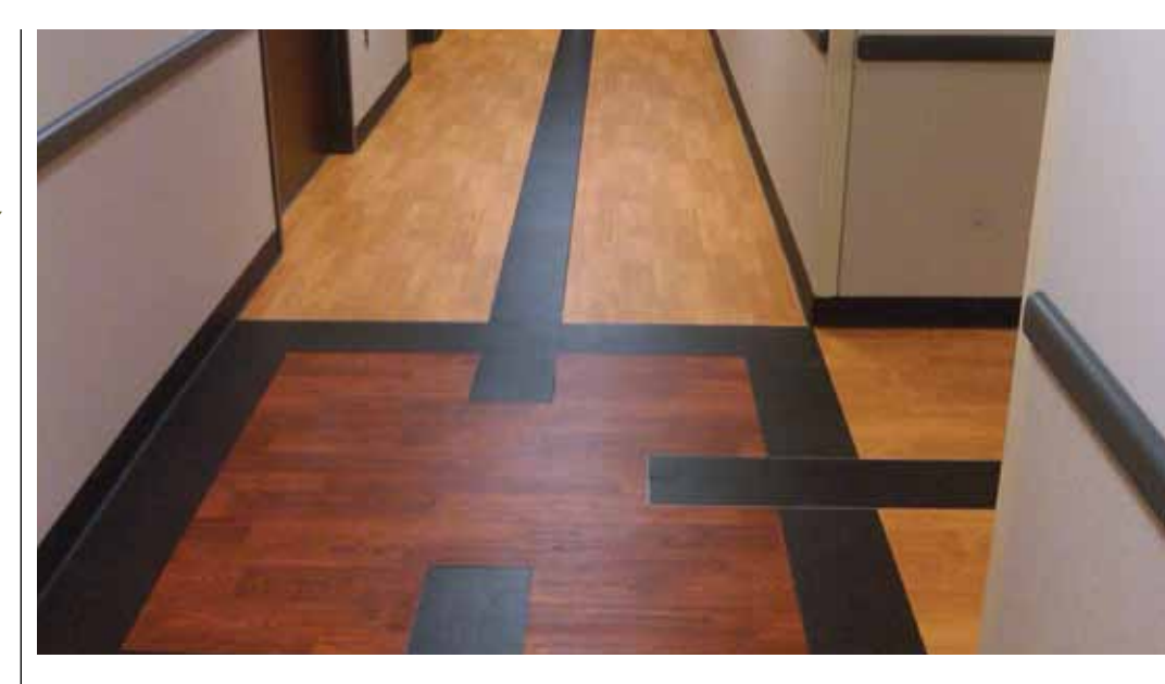
First floor renovation of the Iowa City Department of Veterans Affairs by Covenant Construction Services (hallway pictured)

At that first meeting, one immediate opportunity identified was whether or not Covenant qualified as a Service Disabled Veteran-Owned Small Business (SDVOSB). This program is one of several small business initiatives that the federal government has created to promote opportunities for capturing federal work. Qualified companies may be eligible for sole source or "set-aside" contracts, which limit competition and increase the company's chances for securing sales. CIRAS recommended that Covenant apply for verification as an SDVOSB, and the company received its official verification in 2010 from the Center for Veterans Enterprise.