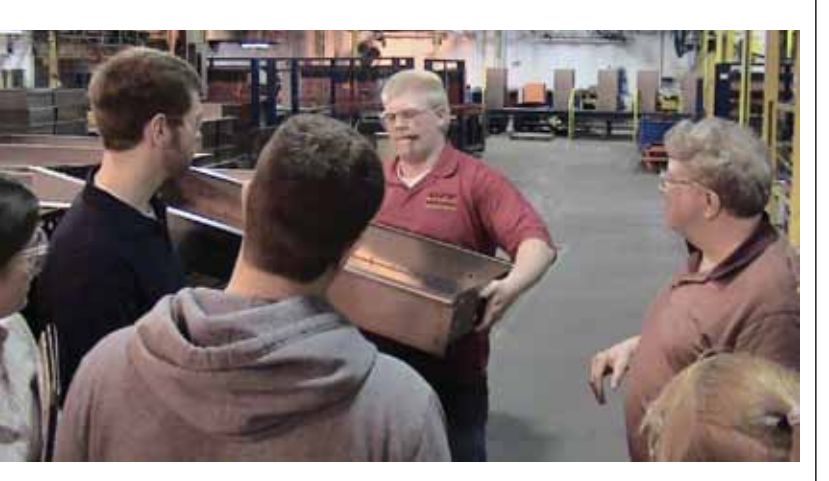
The Senior Capstone Design Program is the culmination of engineering education for lowa State students. Each semester, CIRAS matches students in the program with sponsoring companies and real-world projects.

Brown Medical, in Spirit Lake, Iowa, participated in Iowa State's capstone program for the first time last year. The project required the students to design an automated solution to packaging. A solution was needed because of a shift in supply chain for the company, and improvements were necessary to enhance packaging efficiency. One of the teams took a look at the big picture and decided to focus on work cell redesign rather than automation.