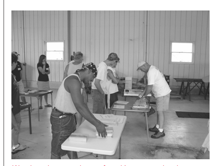
Wood products employees found it easy to relate lean principles to their own workshops as they constructed dovetail drawers as part of the training.

For more information please contact Verl Anders at 515-231-4497; vanders@iastate.edu, or Jeff Mohr at 515-294-8534; jeffmohr@iastate.edu.