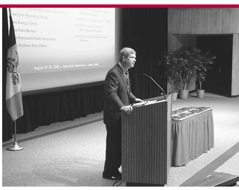
Governor Tom Vilsack addresses participants at the 2005 Biobased Industry Outlook Coference. A record number 400 people attended.

A broader vision was presented by Congressman Tom Latham (R-Iowa), who offered five reasons to build the nation's bioeconomy, with a particular emphasis on the biorenewable fuels sector, including national security, the surplus of agricultural products, environmental concerns, the rising price of oil, and rural development. These reasons have been widely