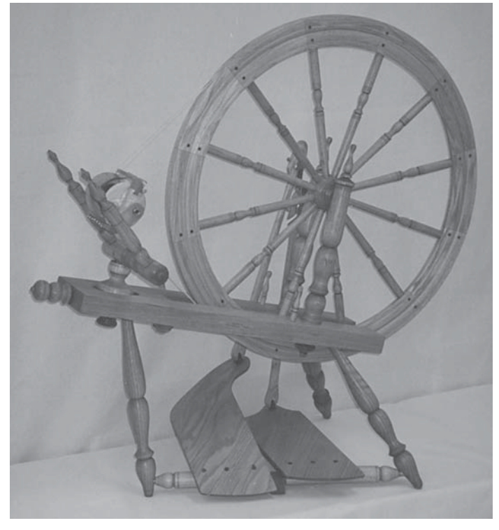
An inventory program kept track of production costs of each part of the spinning wheel.

"This is the greatest system I've ever seen. It works so well and is so easy to use." — Rick Reeves.